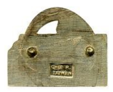
1983 V Reverse Showing Larger Logo