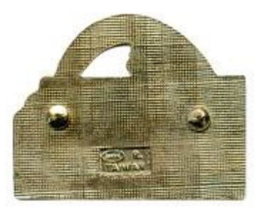
1983 Reverse Showing Smaller Logo