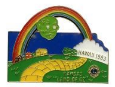
1983 V Reverse