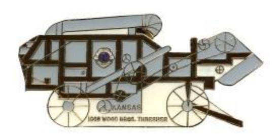
1982 V-2 This probably is a sample.